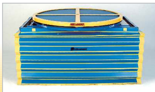
The Bishamon accordion bellows skirting.