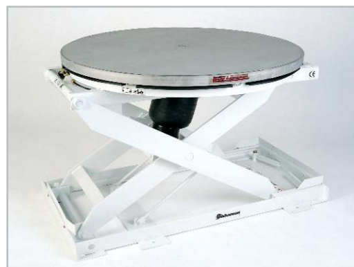
EZ Loader with wash-down package consisting of USDA accepted paint and stainless steel rotating platform.