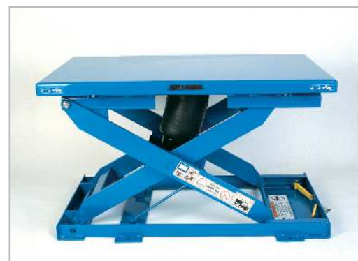
Bishamon EZ Loader with rectangular narrow non-rotating top.