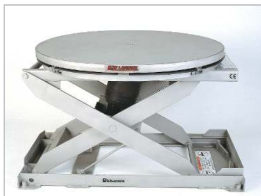
EZ Loader constructed of 304 stainless steel for food and washdown applications.