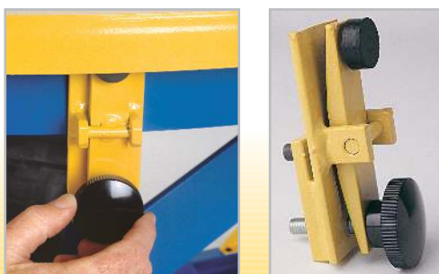
Bishamon brake keeps rotator ring from turning.