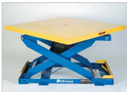
Bishamon EZ Loader with solid rectangular rotating top.