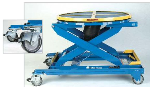
Caster portability cart features two fixed and two swivel casters with brakes. Inset is close-up of swivel casters.