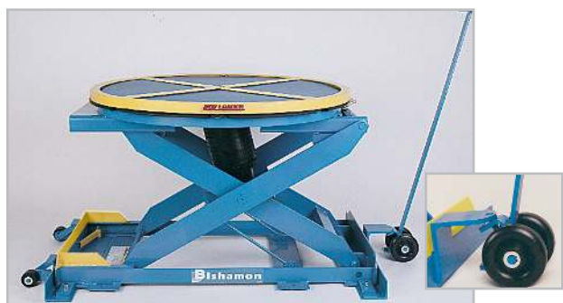
Semi-live portability for moving unloaded lift features two wheels and a dolly handle. Inset is close-up of dolly wheel unit.